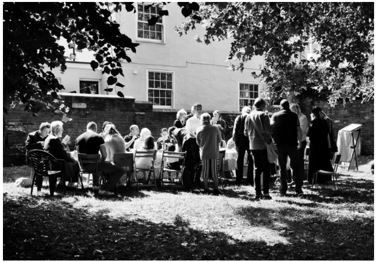
We had a lovely bring-and-share picnic lunch on 20 August in honour of the Repose of St Helen, our Summer Feast, followed by Veneration of the Relics of the True Cross and St Helen.