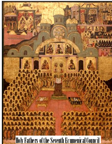
Holy Fathers of the Seventh Ecumenical Council

It is the Councils of the Church which decide what is the truth