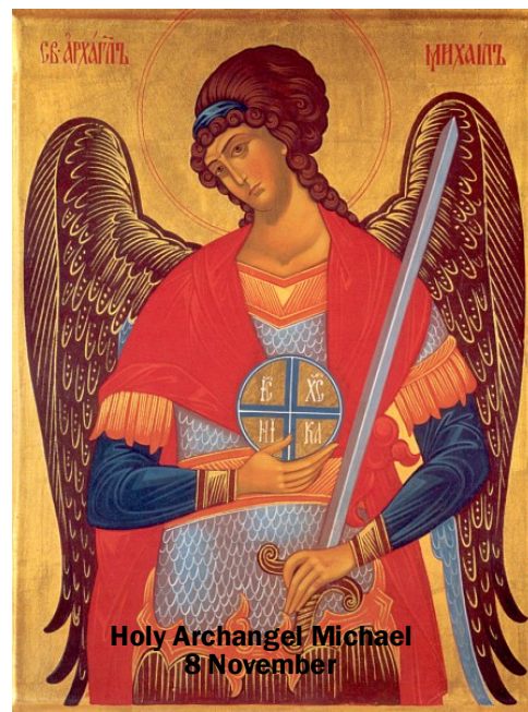
Holy Archangel Michael 8 November

CHILDREN OF ST HELEN Saturday 4 November 11 am - for pre-school & primary children