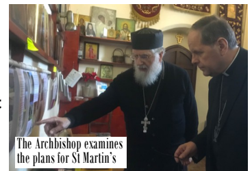
The Archbishop examines the plans for St Martin's

The Archbishop was in Colchester to give a little speech at the annual so-called "Thieves Dinner", attended by the great and good of the town. In his speech he neatly linked together the stories of St Helen from Colchester, Cyprus and Jerusalem. It was good to hear.