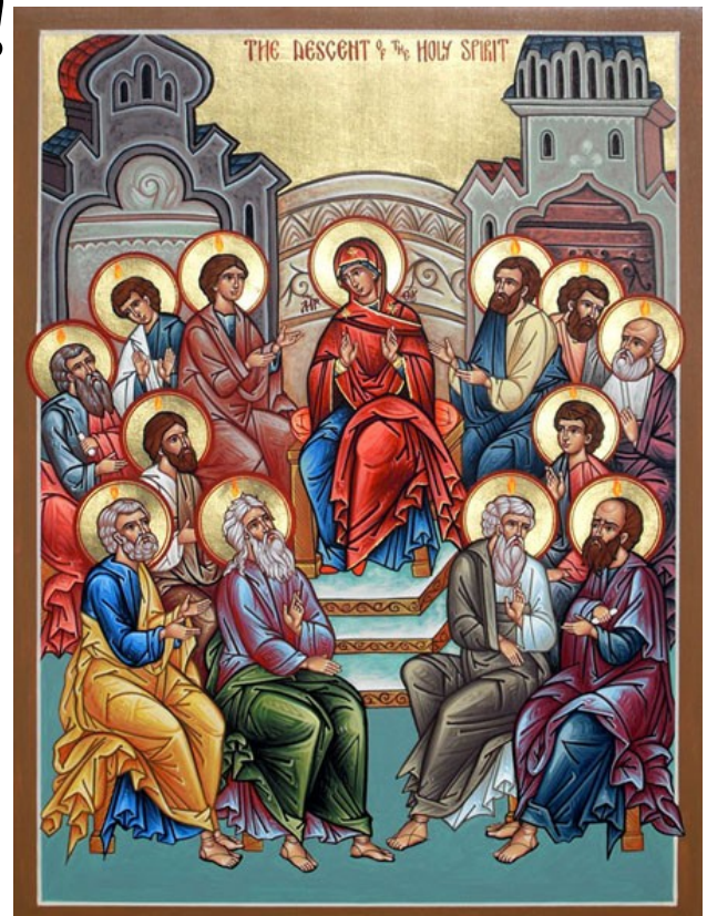
One form of the icon of the Descent of the Holy Spirit. The Twelve Apostles (Paul replacing Judas), surrounding the Theotokos. Each Apostle has the fire descending on him.