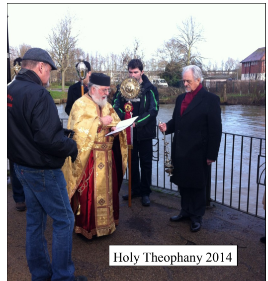
Holy Theophany 2014