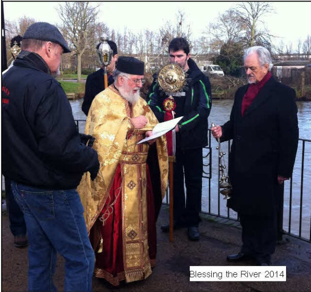
Blessing the River 2014

THE THEOPHANY ICON shows Christ being baptised by John, the Forerunner and Baptist, at the River Jordan. Above Christ is shown the coming forth of the Father's Word This is my beloved Son , and the Holy Spirit in the form of the Dove. Thus the Three Persons of the Holy Trinity are revealed for the first time. The Holy Angels gather in adoration of the Triune God. The faithful collect some Holy Water after the Great Blessing in Church, and request the Priest to bless their home.