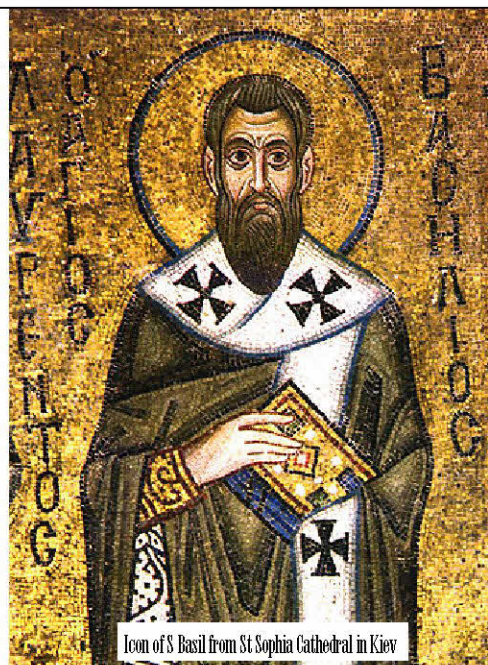
Icon of S Basil from St Sophia Cathedral in Kiev

A great thinker and theologian, a teacher and preacher, a man of deep spirituality yet also an administrator, a letter-writer in abundance, involved in church politics—St Basil would have been a man of stature in any society. He had an excellent education and was deeply learned. Yet he was a simple monk, and he wrote the Rule which is still the basis of Eastern monasticism. He founded the first recognisable hospital. He became Bishop of Caesarea in Cappadocia in what we would call Turkey, and was widely respected by Christian and non-Christian. He was one of seven Saints in an amazing family. He died in 379, and his feast is on 1 January . He is also commemorated on 30 January with St John Chrysostom and St Gregory the Theologian as one of the Three Hierarchs and Ecumenical Teachers .