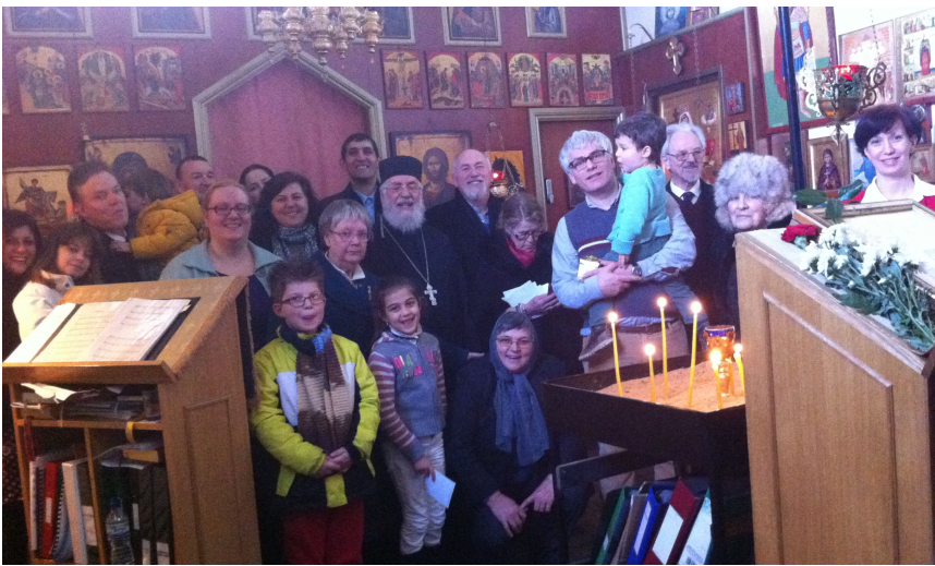
Last month in this spot we had a photo of some of the folk at Clacton. Lest we breed any rivalry, this month we have one of St Helen's on Christmas Day, which proved a very happy service. After Holy Liturgy we had carols in English, Greek, Romanian and Serbian.