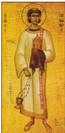
St Stephen the first Deacon or servant or minister of the church & first Martyr.

The worshipper normally stands, but may sit down at certain points, especially during the Apostle and sermon. Even the disabled and elderly should attempt to stand at least for the Gospel, Creed and Our Father.