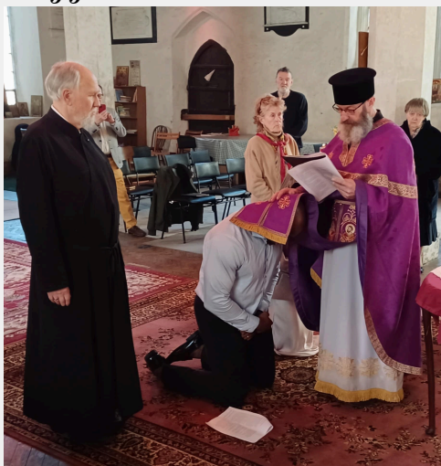
The Prayer of Absolution at Holy Chrismation