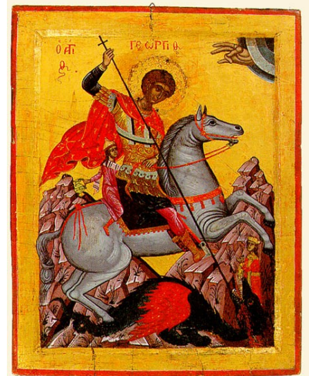
St George the Trophy-bearer, pray to God for us.