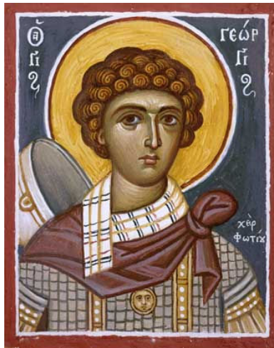
This powerful icon of St George the Great Martyr is by Photios Kontoglou, the great master who renewed icon painting in Greece between the Wars (d 1965). It has been my companion for very many years. We keep his feast as Patron of England on 23 April with Holy Liturgy at 9.30. I plan to bless and distribute roses on this occasion.